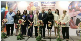
VIPs in the opening ceremony include 开幕式嘉宾包括:

The head of ministry, Department of Trade and Industry (DTI)